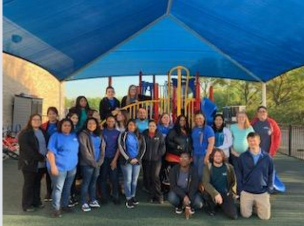
Children's Center for Autism at Sugar Land