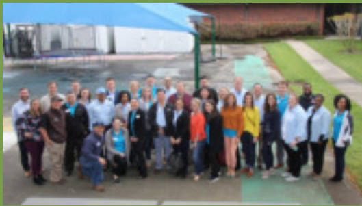
60 members of the Class of 2019's Leadership Forum from the Fort Bend Chamber visited Texana to learn about all that we do and they were able to tour the Children's Center for Autism.