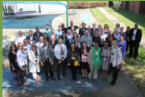
Leadership Fort Bend Class of 2019 with the Central Fort Bend Chamber joined us for breakfast to learn about Texana Center and our autism services.