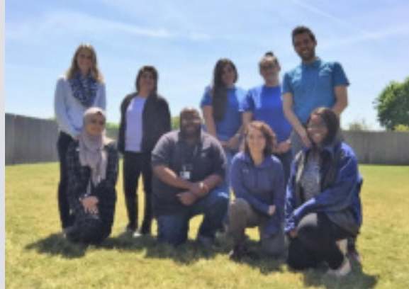
Behavior Stabilization Team