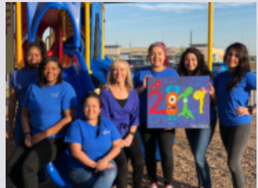
Children's Center for Autism at Fulshear