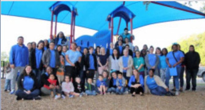
Children's Center for Autism at Rosenberg